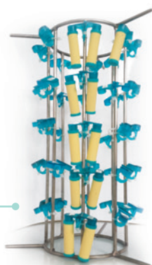
Rack for diffusive sampling supports